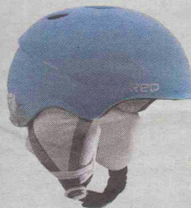
"HiFi II" helmet, £85, by R.E.D. (redprotection.com)