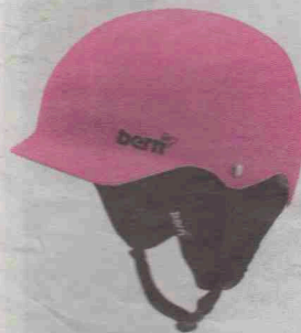
"Muse EPS", £75, by Bern at Ellis Brigham (0844 3721010)

It's all I need to hear to put me back on track. Later I enthuse to my husband about what she has said. "Um," he sniffs. "I bet she says exactly the same thing to everyone."